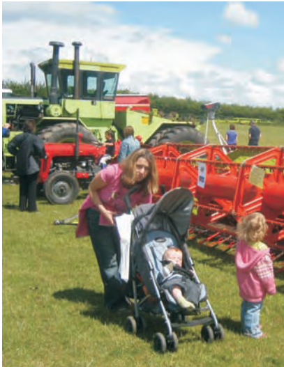
Offley Hoo Farm